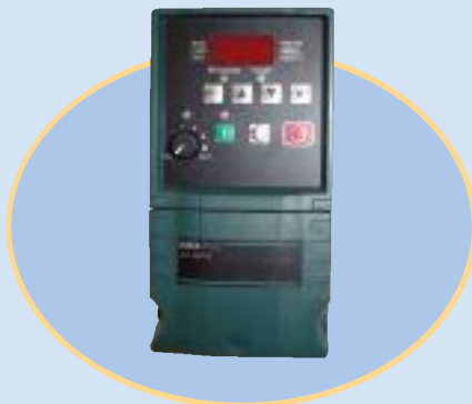
► AC DRIVE CONTROLLER For 230-3 Phase and 460-3 Phase Motors