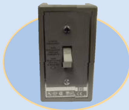
► STARTER WITH ON/OFF SWITCH For 110-1-60 Motors