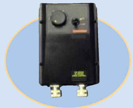
► DC SPEED CONTROLLER For 1/4 - 1 HP DC Motors 110-1-60