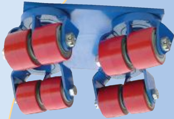
34 Ton Dolly