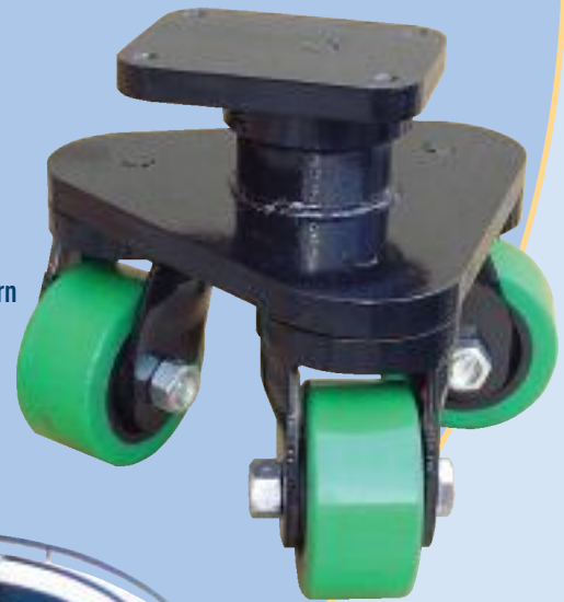
Heavy Duty Turn Table Dolly