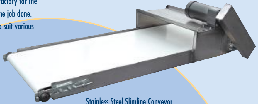
Stainless Steel Slimline Conveyor

If you don't see what you need in our catalog, consult the factory for the design and engineering of the specific model that will get the job done. Here are some examples of specialty items we have built to suit various custom fit jobs.