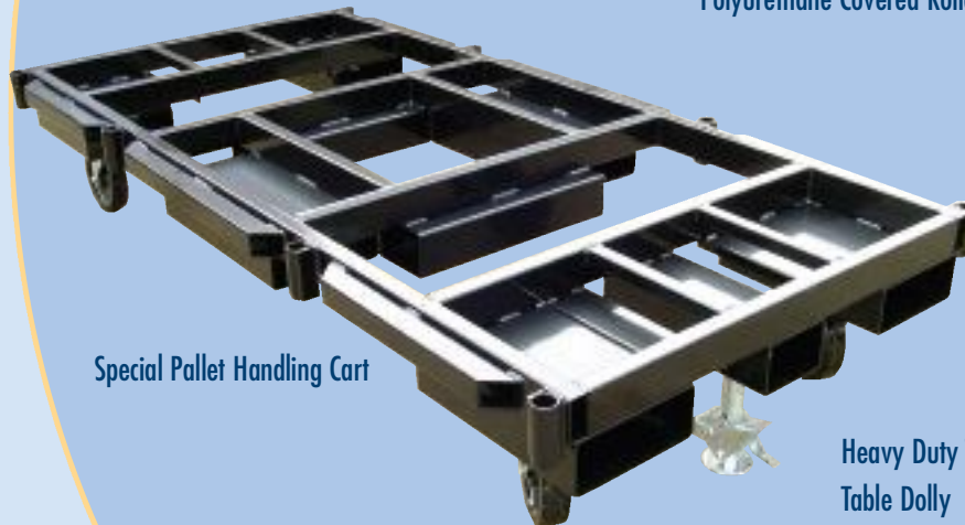
Special Pallet Handling Cart