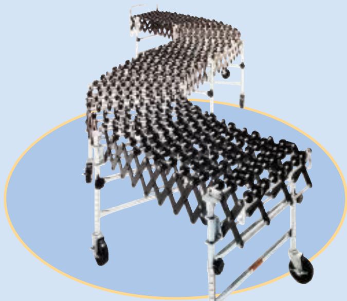
Accordion Wheel Conveyor