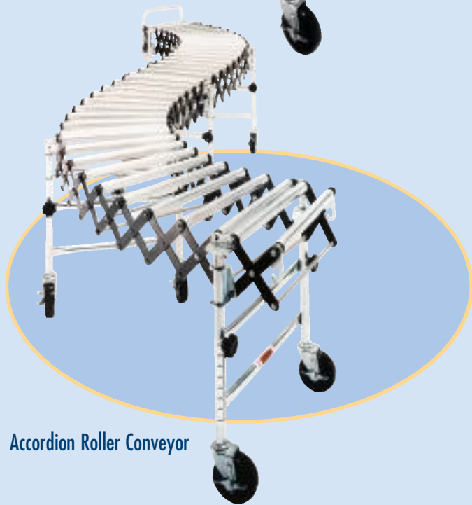
Accordion Roller Conveyor